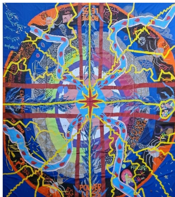
Mandala depicting Christian life journeys

Hope you will make a special effort to attend the October 15 service and enjoy the opportunity to reflect on your journey and the journey of our St. Benedict’s community.