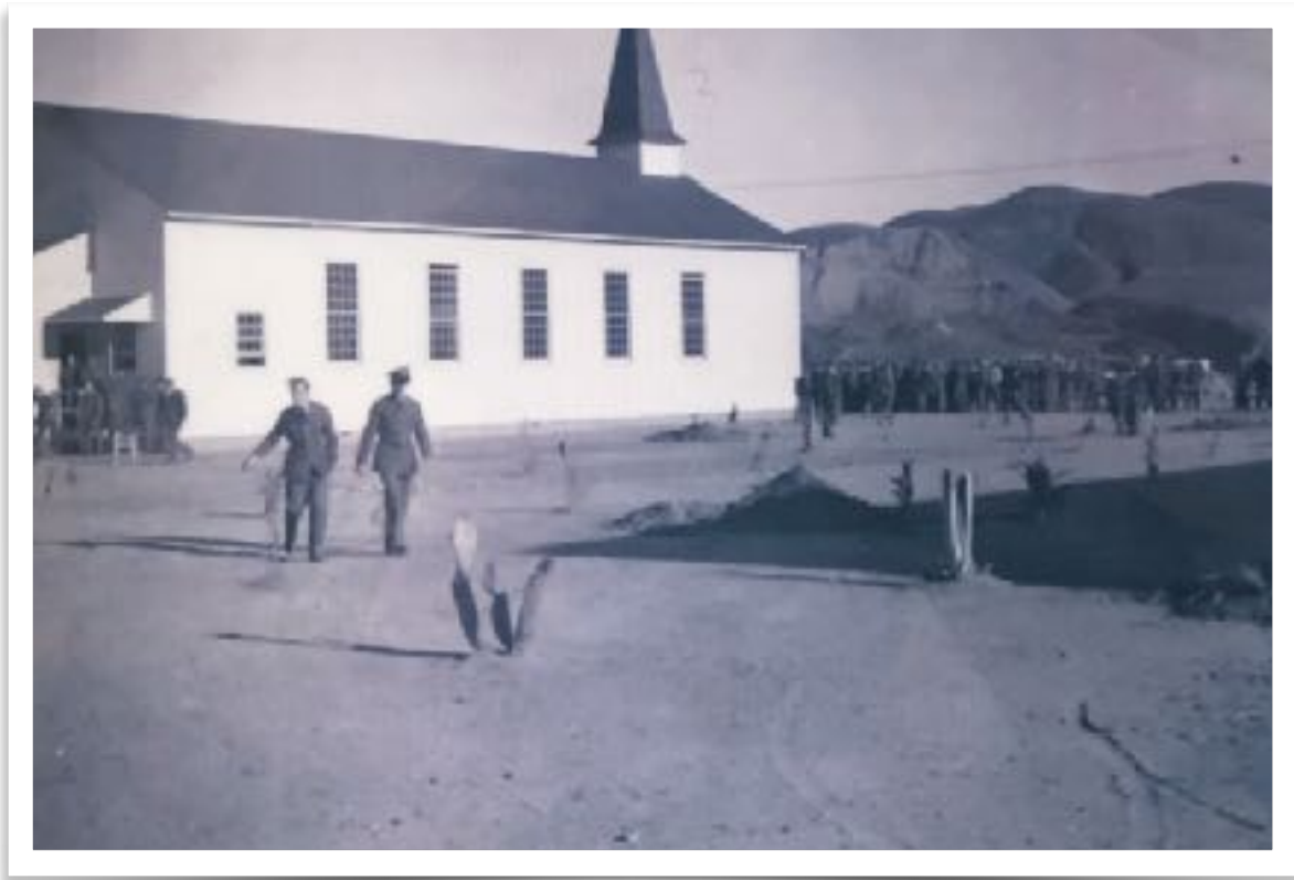
St. Benedict's building was built at Camp Roberts in 1941 and moved to its current location the 1990s.