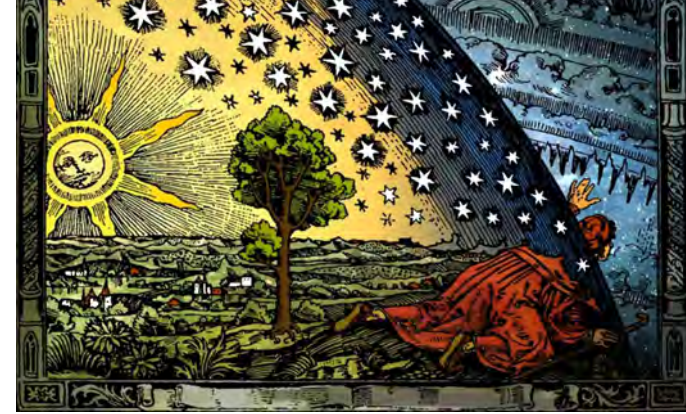
how can we learn, or learn anew, how to see God and human life dynamically and mutually related to the universe?. Moltmann, Ethics of Hope, Fortress Press, 2012, p. 135]