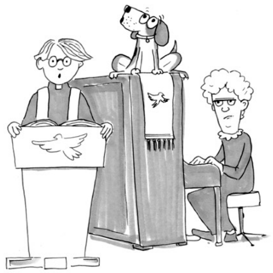
Please open your hymnals to 377 as we sing together, The Beagle Unto Heaven Doth Bay...with accompaniment.