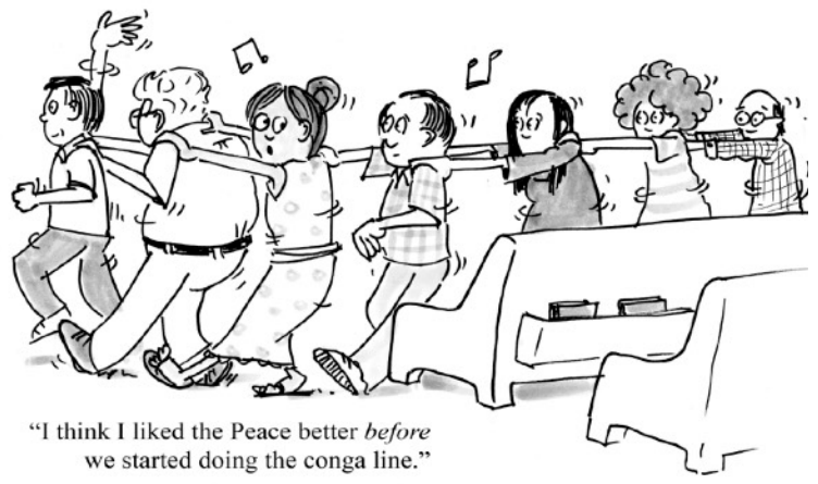
"I think I liked the Peace better before we started doing the conga line."