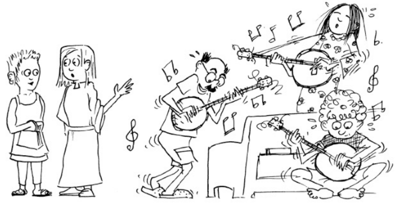
We have the Reflective Service from 8 to 9. That's followed by the General Service from 10:30 to noon...which is immediately followed by the All-Banjo Service from noon to 2.