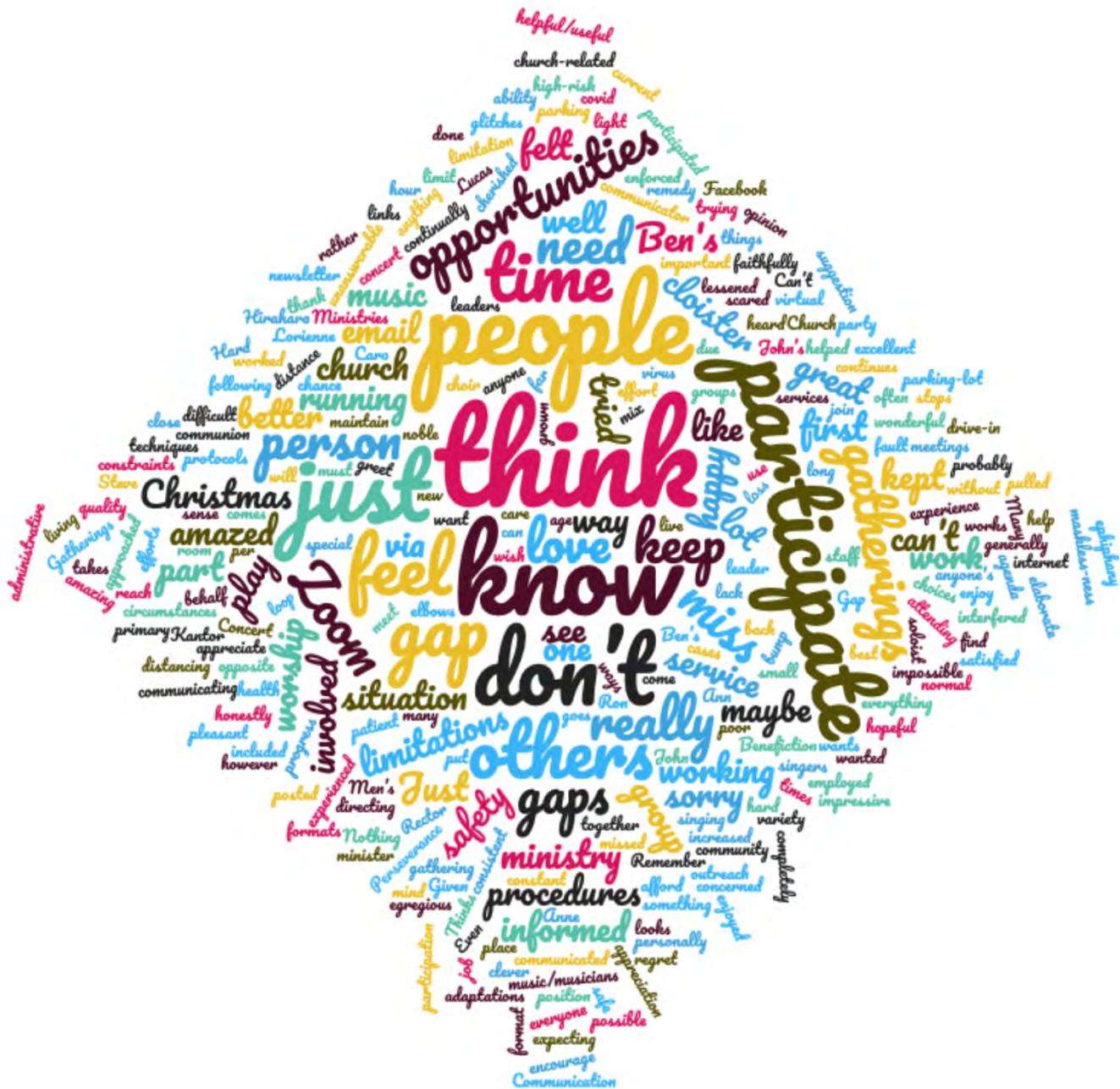
Word Cloud Question 3 v1