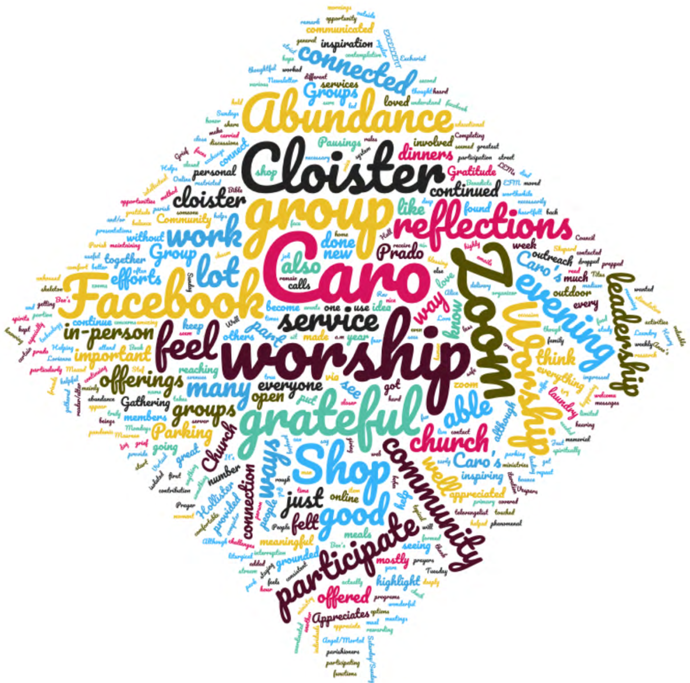
Word Cloud Question 2 v1