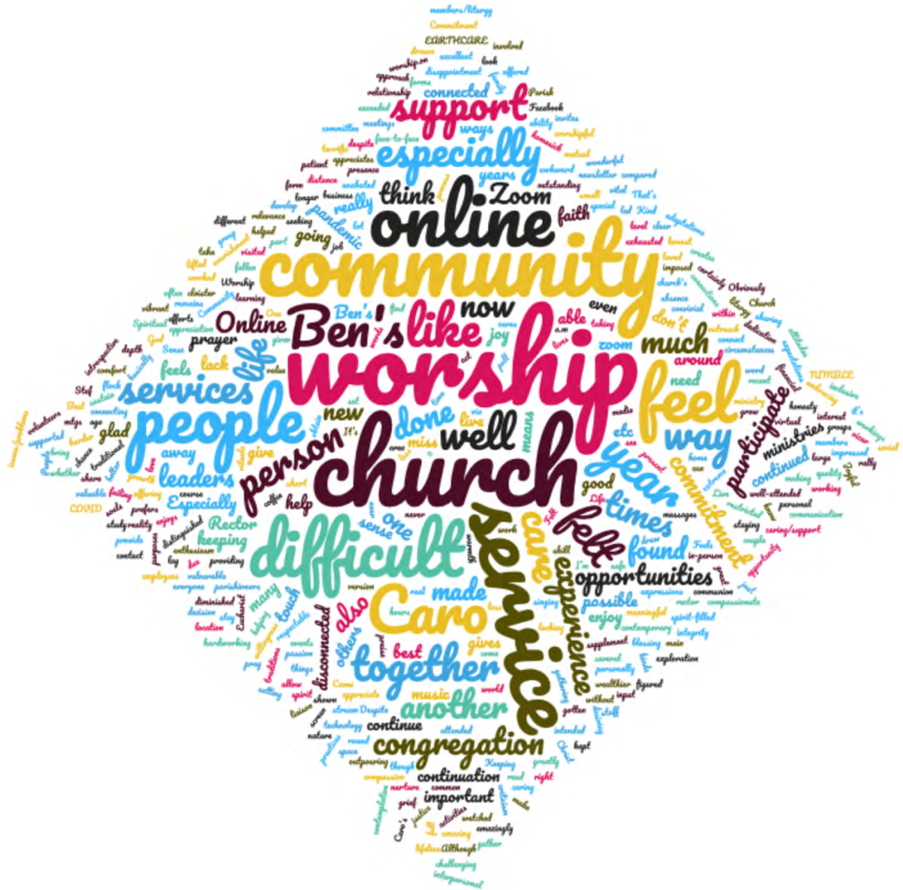
Word Cloud Question 1 v1