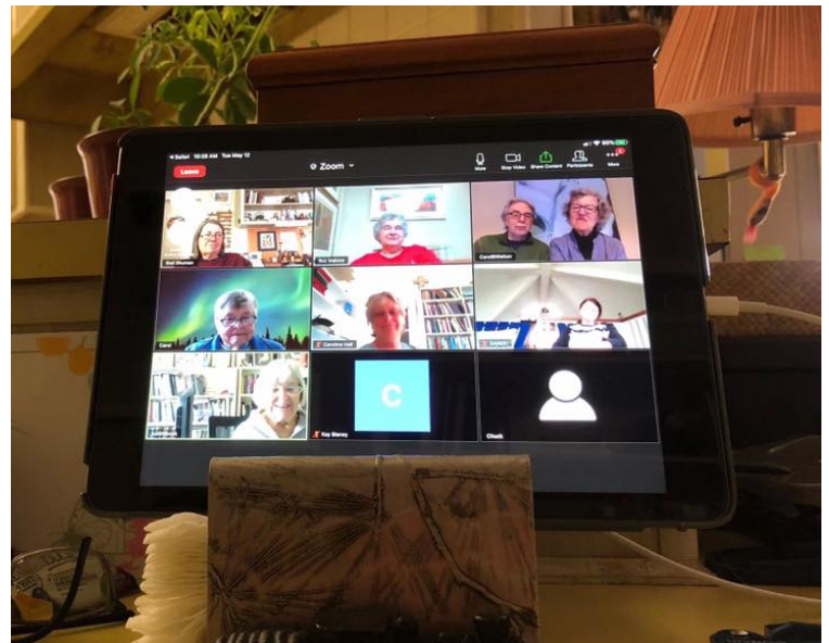
Photo: Worship and Church Business is conducted via Zoom in 2020.

There will be a Thanksgiving morning service at roam on Facebook – just a short one so that we can give thanks together. See you then.