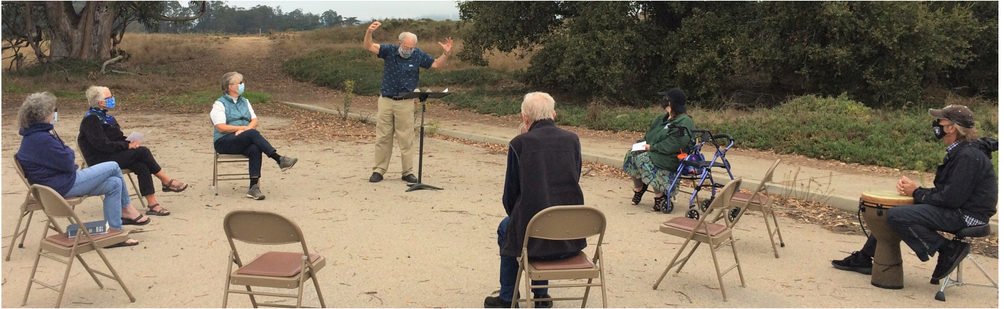
The People's Worship on the grounds near the St. Benedict garden.