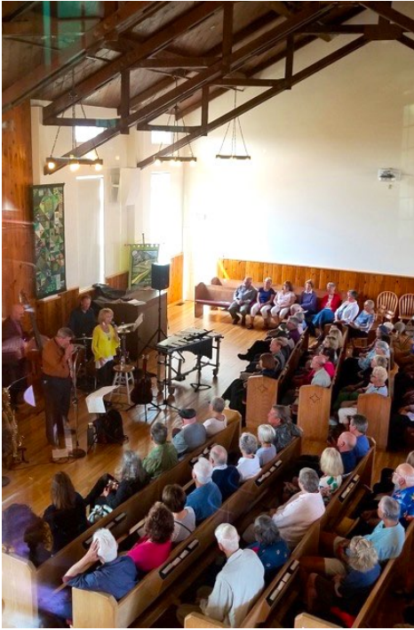
More pictures of people (and food!) at the Jazz Concert.