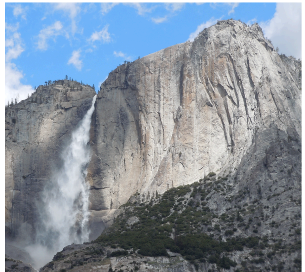
Yosemite Falls, May 11, 2018, Earth Care Retreat